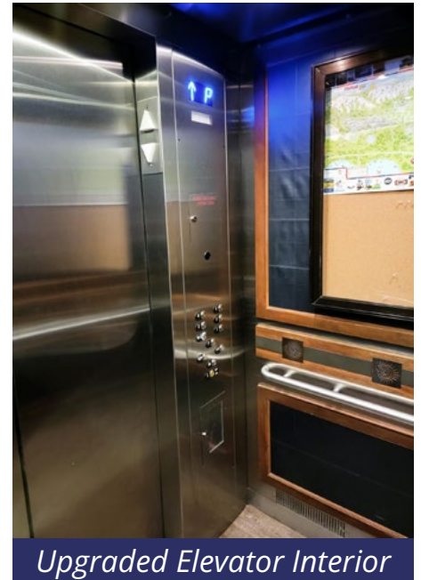
Upgraded Elevator Interior

The large wooden benches that form the barrier between the roundabout and the breezeway have reached the end of their useful life. The HOA is working with the CVMA to consider alternatives that include the “lift chair” type benches as seen in the forum next to the Umbrella Bar.